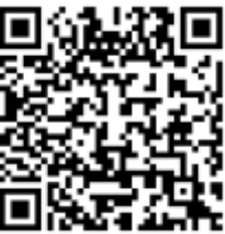
Gay Men, Lesbians Under Nazi

While The Holocaust is firmly planted in the past, it's important to be aware that persecution and systemic genocide of LGBTQ+ people still exists in many countries, today. There are currently 70 countries that criminalize same-sex intimacy. I have a friend who had to leave his homeland to ensure his safety; his story is horrifying. If you would like to help provide safe passage for LGBTQ+ people or simply learn more about how LGBTQ+ people are persecuted, a wonderful humanitarian organization is Rainbow Rail-