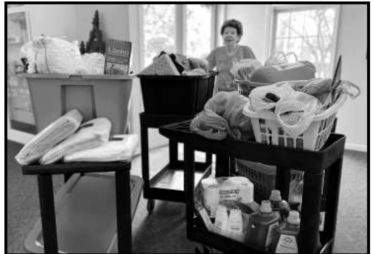
All the donated items for the Seita Scholars program

Thank you for the generous donation of supplies and monetary support for the Welcome Packs that support Seita Scholars at Western Michigan University. Our congregation has supplied more than three full Welcome Packs which will be delivered to WMU this week.